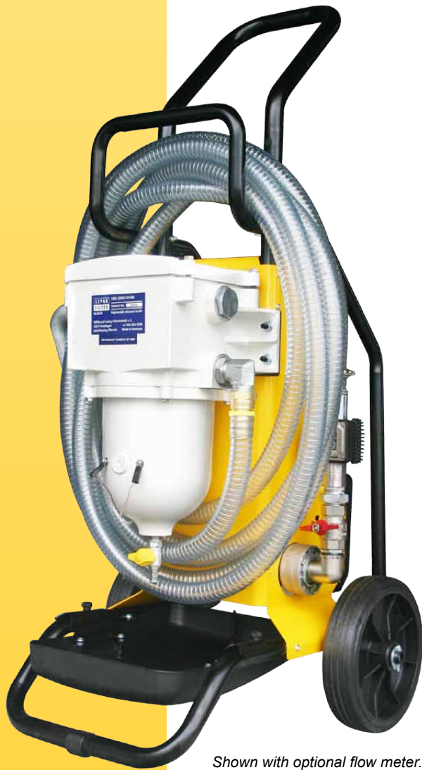
Shown with optional flow meter.