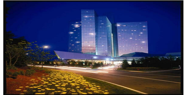
Mohegan Sun Casino, Uncasville, CT

"No matter how well maintained and tested your stand-by generators are, if you don't maintain the diesel fuel in your storage tanks, your generators WILL FAIL."