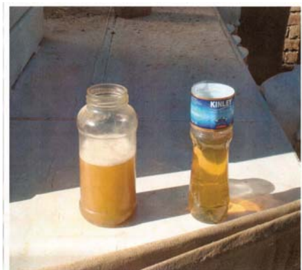
US Embassy United Arab Emirates After 1-Pass Thru DPS

AN EASY TO USE SYSTEM FOR IN-HOUSE MAINTENANCE OF STORED DIESEL FUEL