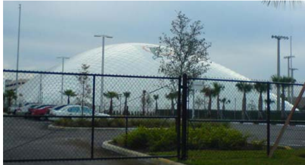
Miami Dolphins Training Camp, Davie, FL