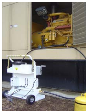
Mohegan Sun Casino DPS-600 Portable